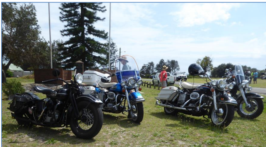
Harley Heaven at Natureland's Hat Head Rally