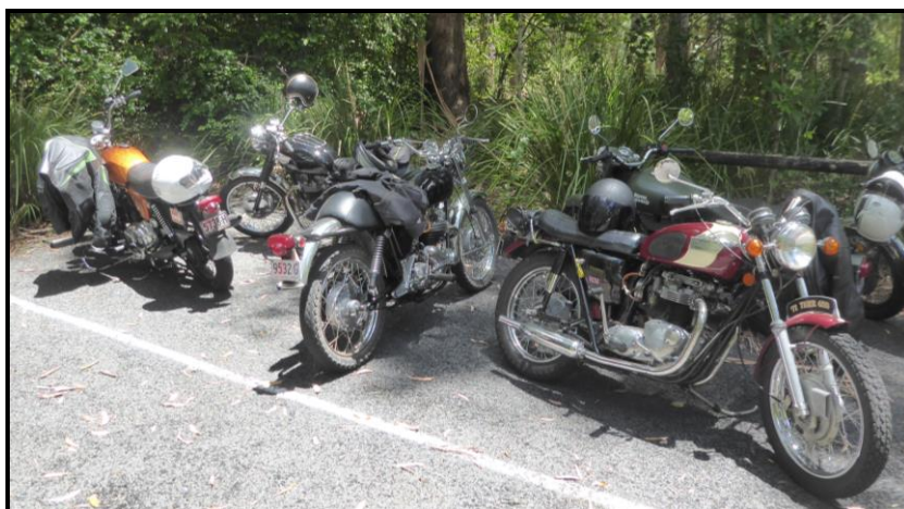
Club Christmas Party: The “Pommy Carpark”