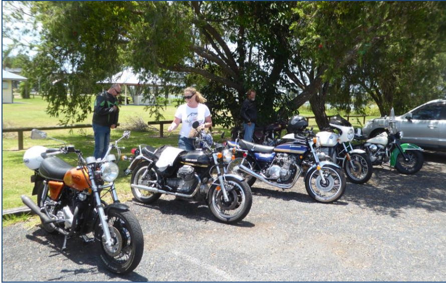
Club Plated Bikes at Smithtown Pub

A big start of about 16 bikes, but the numbers dwindled due to the call of coffee in Nambucca and by Smithtown, it was a small crew but all the bikes, bar one