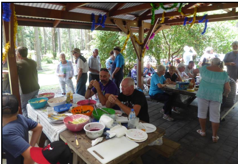
Club Christmas Party: The Eating and Drinking